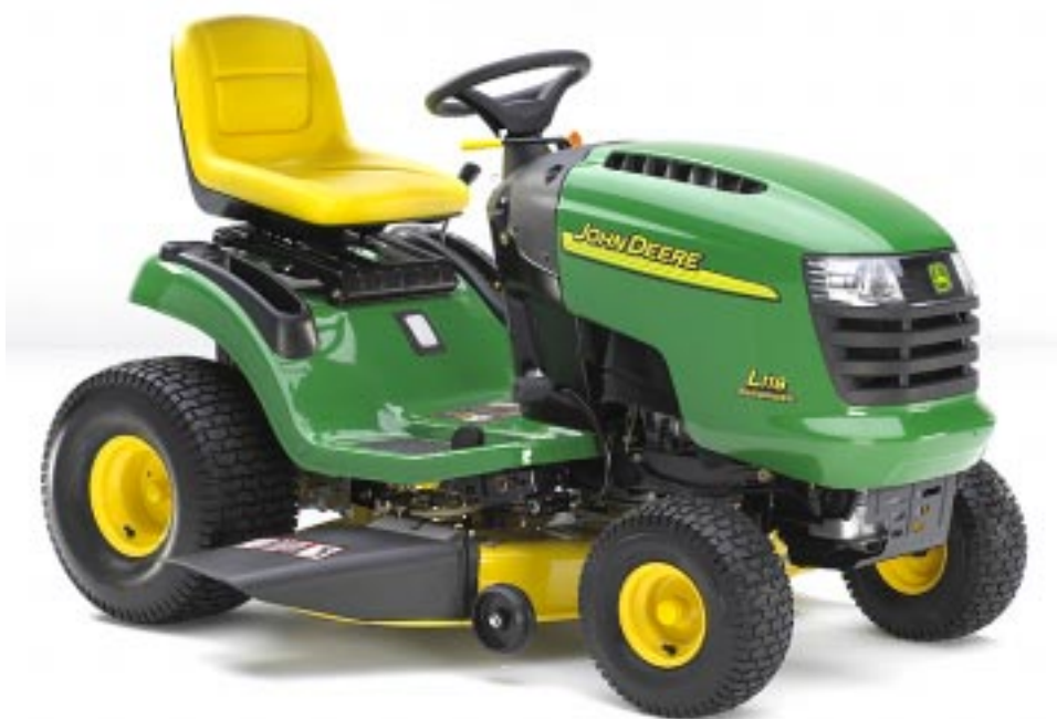
L118 Hydrostatic Drive Lawn Tractor, 22 Horsepower and 42-in. Mower Deck