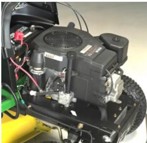
L110 17.5 horsepower Kohler engine shown

The John Deere L Series Lawn Tractors use Briggs & Stratton and Kohler engines. These engines provide plenty of power and torque to handle tough mulching, mowing, and bagging conditions.