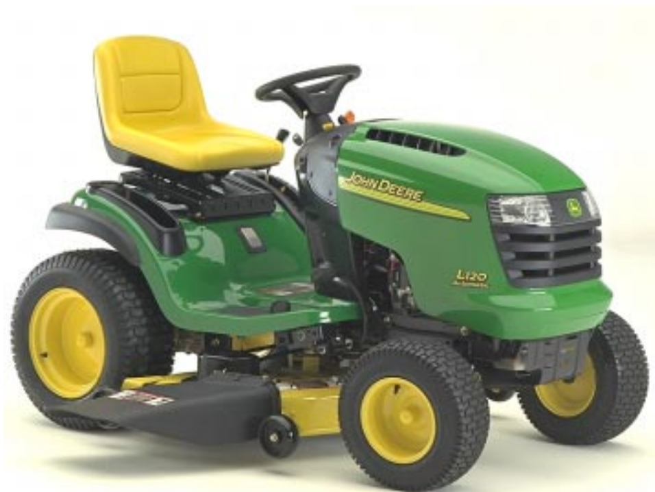
L120 Hydrostatic Drive Deluxe Lawn Tractor, 22 Horsepower and 48-in. Mower Deck