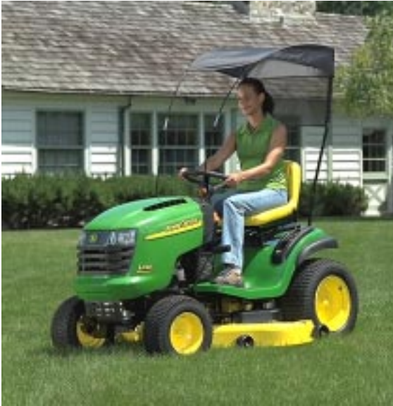
L130 Lawn Tractor shown with optional Sun Canopy

The John Deere L Series Lawn Tractors are recommended for value-conscious homeowners who mow up to: