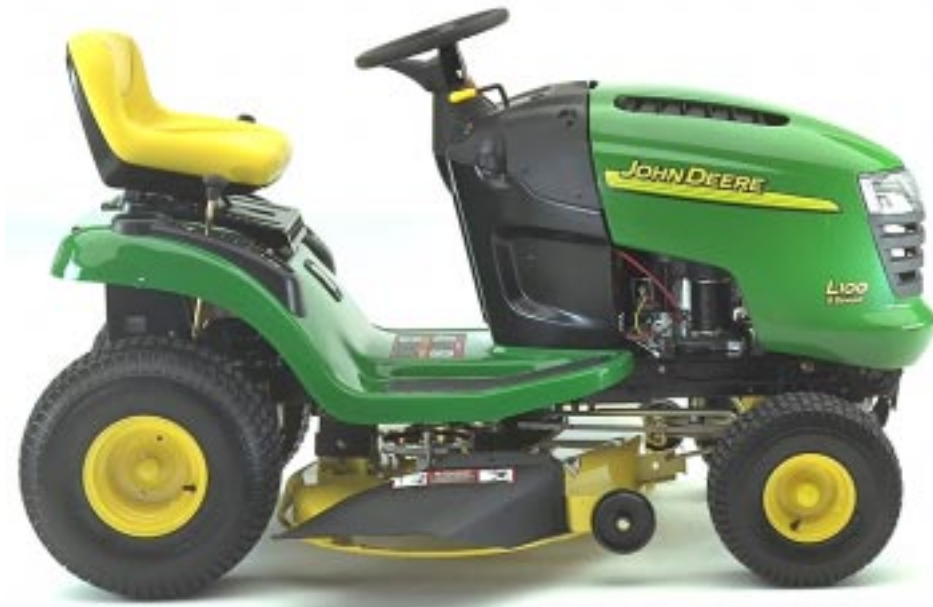
L100 5-Speed Gear Drive Lawn Tractor, 17 Horsepower and 42-in. Mower Deck