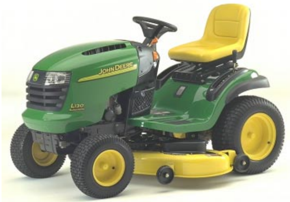
L130 Hydrostatic Drive Deluxe Lawn Tractor, 23 Horsepower and 48-in. Mower Deck