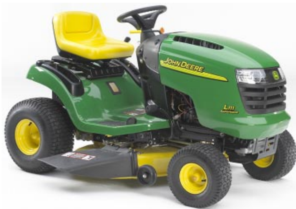
L111 Hydrostatic Drive Lawn Tractor, 20 Horsepower and 42-in. Mower Deck